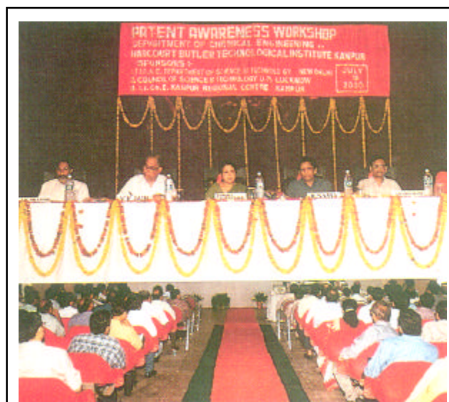
(Workshop held at Kanpur)

In the month of July PFC organised two workshops. The first one was held in association with the Patent Information Centre (PIC) set up by PFC at the Department of Science & Technology, Govt. of Rajasthan, in Jaipur on July 14. The second one was held at Harcourt Butler Technological Institute, Kanpur on July 19. These workshops were attended by around 180 scientists, research scholars and technologists. With these, PFC has conducted 73 workshops in different parts of the country.